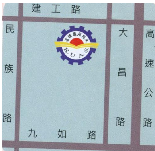
Chien Kung Campus